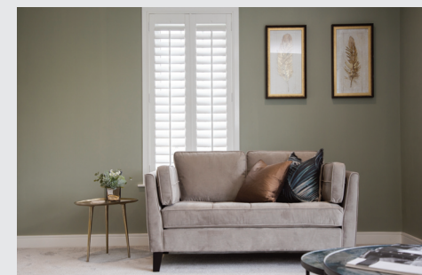
Kitchen and lounge images are actual photographs taken from a previous show home.

CHOOSE YOUR PERFECT ANTRIM CONSTRUCTION HOME